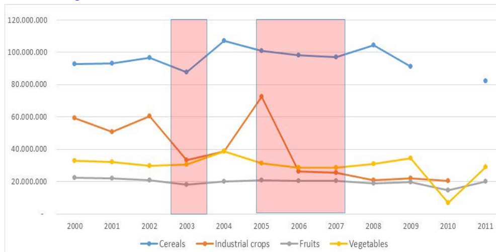
Figure 3 – Yearly crop production (2000-2011; cereals, industrial crops, fruits, vegetables; 100 kg)

The change in crop production ( \Delta Q_i ) was estimated as the difference between the production at the year i (drought year) and the average production of the previous four years 13 . Similarly, the price change ( \Delta P_i ) was estimated by using average annual farming prices provided by the Institute for Services for the Agricultural and Food Market (ISMEA) 14 , as the difference between the price at the year i and the average prices of the previous four years. The monetary values of the effects of the two drought events were actualised at year 2012 15 in order to make them comparable.