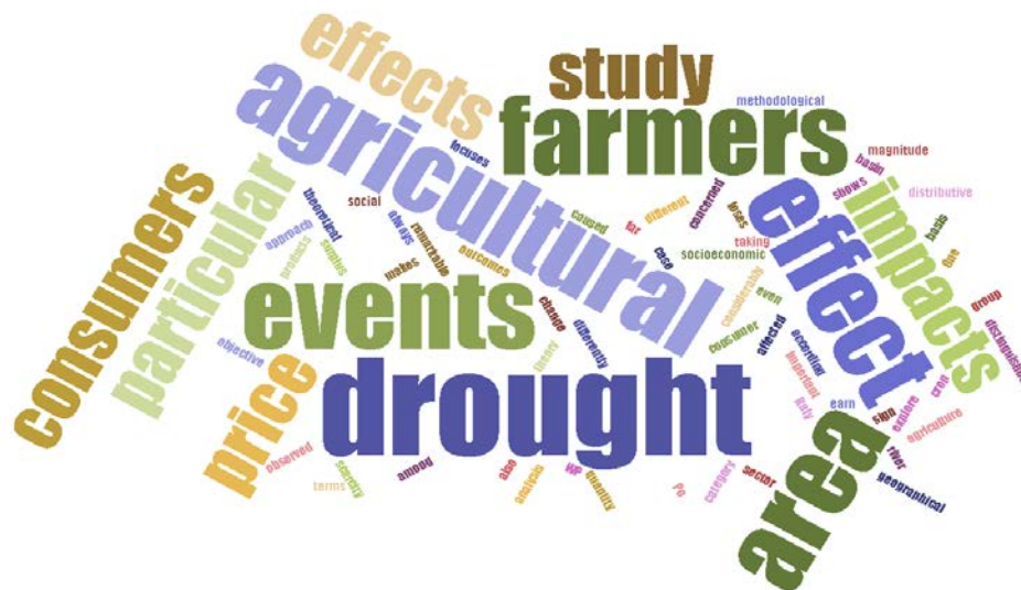
Source: word cloud of the 'abstract'