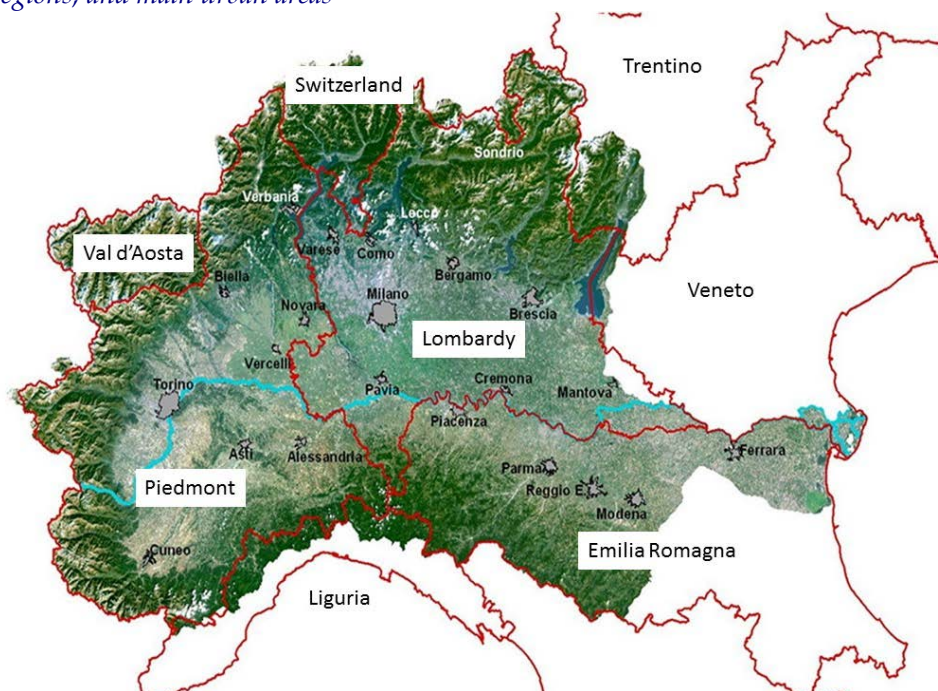
Figure 2 – Administrative boundaries of the Po river basin and of the Northern Italian regions, and main urban areas

The Po River basin, which spans around the longest river in Italy (652 km), with 141 tributary river (see Figure 2 ), covers a very wide area in Northern Italy (74,700 km 2 ), considerably rich and diversified in geographical, demographic and socio-economic terms. It accounts for a total population of about 17 millions of inhabitants, with an average demographic density of 225 inhabitants/km 2 , higher than the average density in Italy (180 inhabitants/km 2 ). It is characterized by the presence of some big urban agglomerations, like Milan and Turin, several medium size urban centers 5 , and vast rural areas, either in plain or in hilly and mountain areas 6 . Seven Italian administrative regions 7 , Canton Ticino (Switzerland) and some areas in France are encompassed in it, and about 3,200 municipalities.